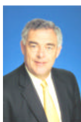
Paul McGrath (FG)