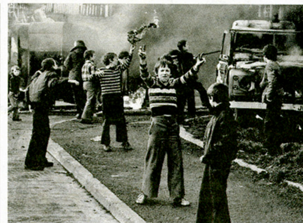
▲ British army soldiers facing hunger-strike protesters in west Belfast in 1981

"I wanted it to be a memorial to the people that had been killed," he said, speaking by phone from his home in Belfast. "I wanted to record